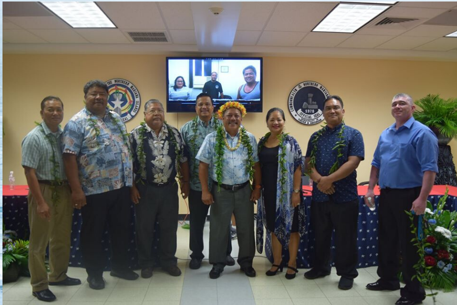
State of the Municipality Address