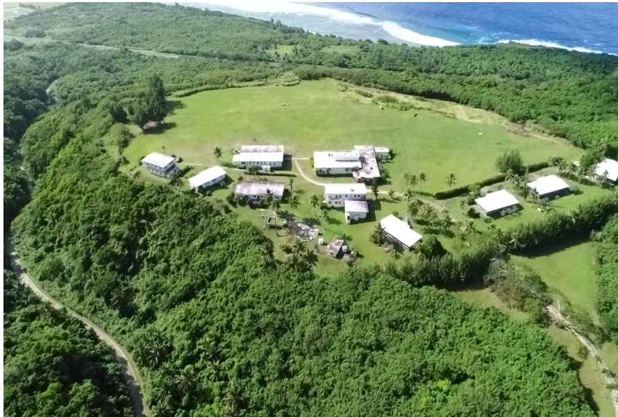
HOPE Recovery Center Marpi, Saipan, Commonwealth of the Northern Mariana Islands