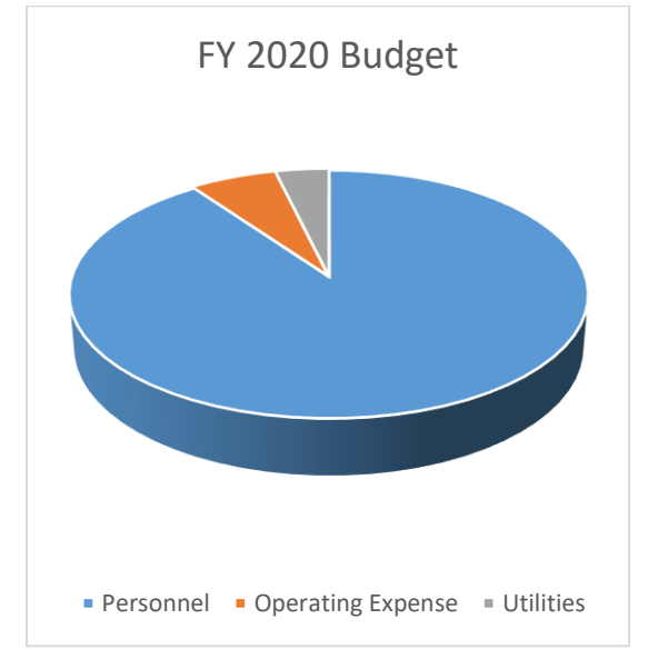
FY 2020 Budget $213,487