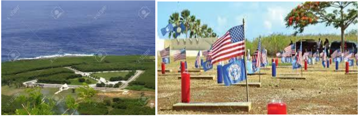
All arrangements for military funeral honors for Veterans arranged by OVA.