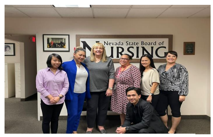
NMI Board of Nursing

CEDA Bldg., suite 207 PO Box 501458 Saipan, MP 96950 (670)233-2263