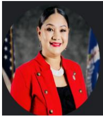
CHAIRWOMAN, COMMITTEE ON RESOURCES, ECONOMIC DEVELOPMENT, AND WORKFORCE (REDW)

Office of Senator Corina L. Magofna 24 th NORTHERN MARIANAS COMMONWEALTH LEGISLATURE HONORABLE JESUS P. MAFNAS BUILDING, CAPITOL HILL P.O.BOX 500129 SAIPAN, MP 96950 (670) 664-8812 Senator.CorinaMagofna@gmail.com