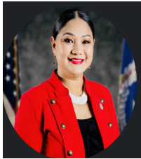
CHAIRWOMAN, COMMITTEE ON RESOURCES, ECONOMIC DEVELOPMENT, AND WORKFORCE (REDW)

Office of Senator Corina L. Magofna 24 th NORTHERN MARIANAS COMMONWEALTH LEGISLATURE HONORABLE JESUS P. MAFNAS BUILDING, CAPITOL HILL P.O.BOX 500129 SAIPAN, MP 96950 (670) 664-8812 Senator.CorinaMagofna@gmail.com