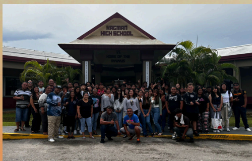
CK Outreach Team, Peers in Recovery and students from Kagman High School after a Drug and Alcohol Awareness Presentation.