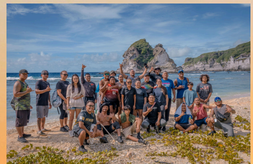
Hike for Recovery to Bird Island for September's Recovery Month