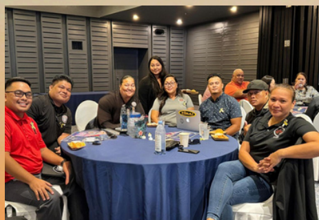
SAAR team attends Blue Ribbon Consortium & Fentanyl Training