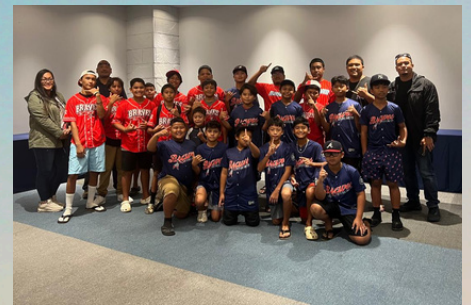
Drug & Alcohol Awareness Presentation with the Natibu Sports Association & the Junior League Braves Baseball Team