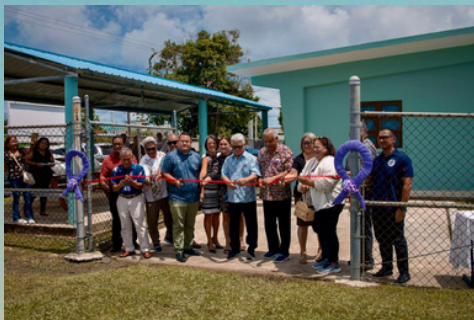
CK Outreach Center Grand Opening & Ribbon Cutting