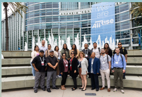
Team CNMI at 2024 All Rise in Anaheim, CA